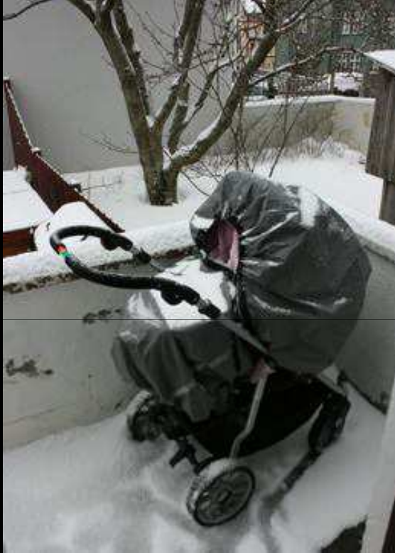
Sleeping infant, Iceland, -20 °C