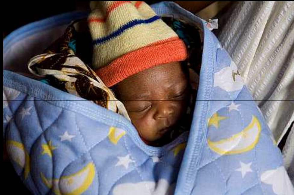
Sleeping infant, Sierra Leone, +27 °C

➡ Physiology , environment, beliefs and behaviour